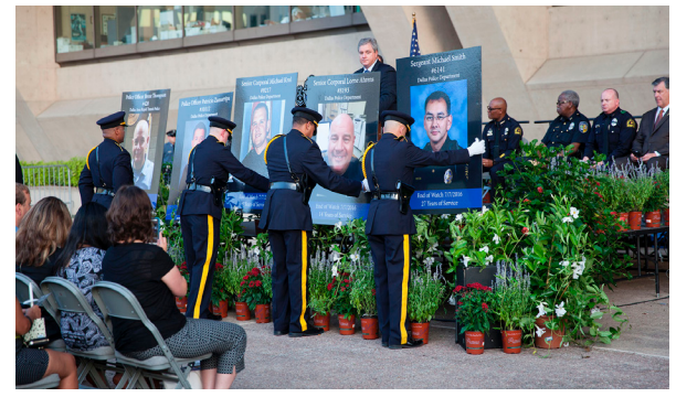
The Honor Guard places five large portraits of the officers killed in last week's sniper shooting targeting police during a 'Dallas Strong' candlelight vigil outside City Hall in Dallas, Texas, on July 11, 2016<sup>864</sup>