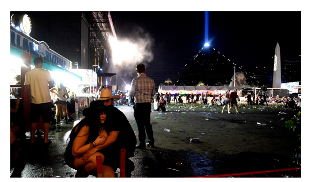
People take cover at the Route 91 Harvest country music festival after apparent gun fire was heard on October 1, 2017 in Las Vegas, Nevada. There are reports of an active shooter around the Mandalay Bay Resort and Casino.<sup>1000</sup>