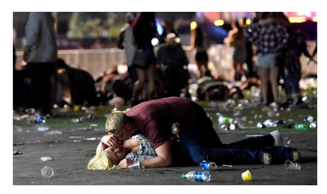
A man lays on top of a woman as others flee the Route 91 Harvest country music festival grounds after a active shooter was reported on October 1, 2017 in Las Vegas, Nevada. A gunman has opened fire on a music festival in Las Vegas, leaving at least 2 people dead. Police have confirmed that one suspect has been shot. The investigation is ongoing. The photographer witnessed