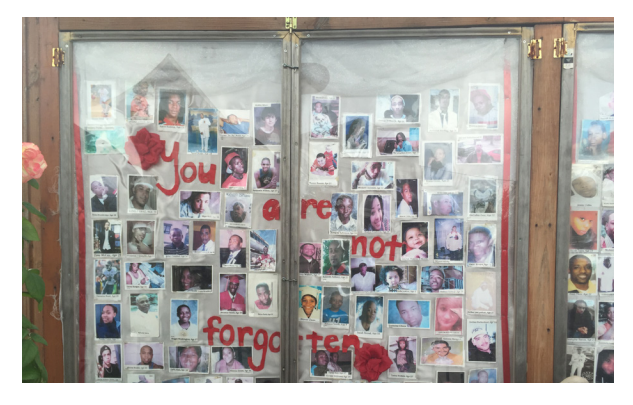
Memorial to more than 100 children and young adults of the St Sabina Community in Chicago who have been killed by gun violence

Children in the USA are not immune from criminal firearm violence. Whether children are caught in