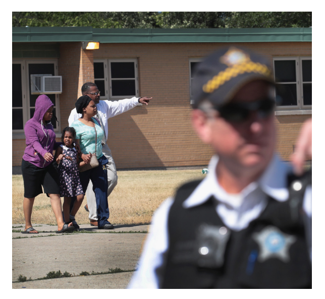
Joseph Warren Elementary School<sup>429</sup>