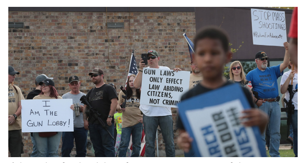
Advocating for the rights of gun owners, a group of demonstrators stage a counter-protest near a March for Our Lives rally on March 24, 2018 in Killeen, Texas. More than 800 March for Our Lives events, organized by survivors of the Parkland, Florida school shooting on February 14 that left 17 dead, are taking place around the world to call for legislative action to address school safety and gun violence.<sup>873</sup>