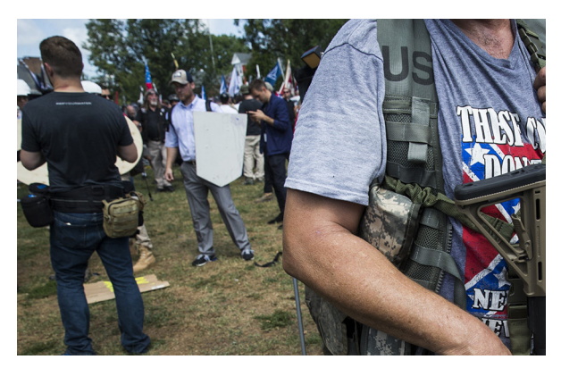
A protester open carries a rifle during clashes with counterprotesters at Emancipation Park, during the 'Unite the Right' Rally in Charlottesville, Virginia.<sup>874</sup>

Forty-five states currently allow open carry of firearms in public in some form. Some states impose restrictions on who may openly carry firearms, what type of gun may be subject to open carry, permitting requirements and/or restricted zones where open carry is not permitted.<sup>875</sup> The premise for allowing open carry of loaded firearms is that they are purportedly needed for self-defense and defense of others in dangerous situations. However, having and displaying a firearm may in fact escalate a disagreement, threat or altercation, leading to a deadlier encounter.